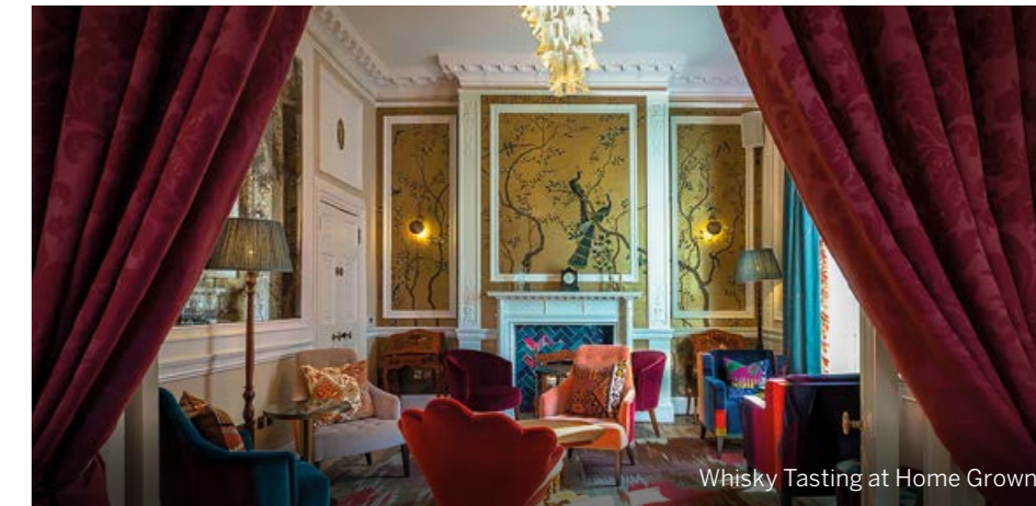
Whisky Tasting at Home Grown