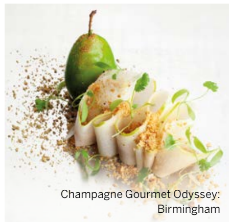
Champagne Gourmet Odyssey: Birmingham

Join Col. Dame Kelly Homes, double Olympic champion and one of the UK's greatest ever athletes, at this Alpine-inspired restaurant in the heart of Stratford. Enjoy a welcome drink, an opportunity to ask your questions and a three-course meal with wine.