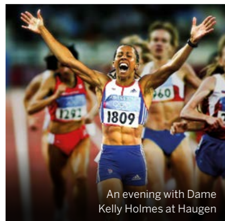
An evening with Dame Kelly Holmes at Haugen

Enjoy a six-course Gourmet Odyssey long lunch exploring the best restaurants of Regent Street and St James's, plus personalised experiences at three top retailers across the area, and an Amex Offer to help you make the most of your festive shopping.