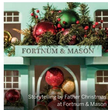
Storytelling by Father Christmas at Fortnum & Mason

Enjoy a 60-minute mindful painting experience hosted by artists from MasterPeace, the boutique Art School, in the luxurious surroundings of The Hari, in the heart of Belgravia. All followed by a three-course lunch, served with Wild Idol Alcohol-Free Sparkling Wine in the hotel's il Pampero restaurant.