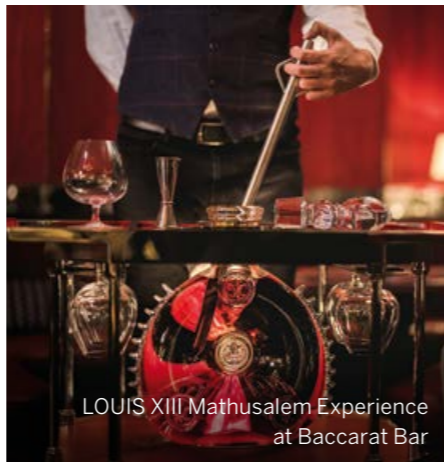
LOUIS XIII Mathusalem Experience at Baccarat Bar