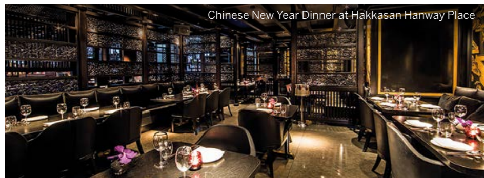
Chinese New Year Dinner at Hakkasan Hanway Place