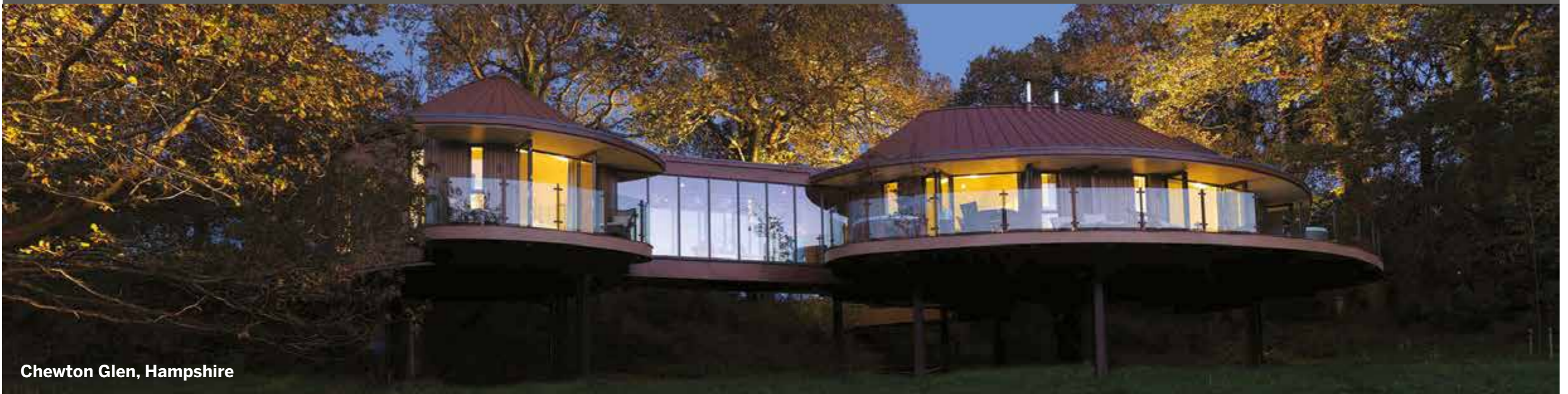
Chewton Glen, Hampshire

Benefits are valid for stays until 31 December 2016.