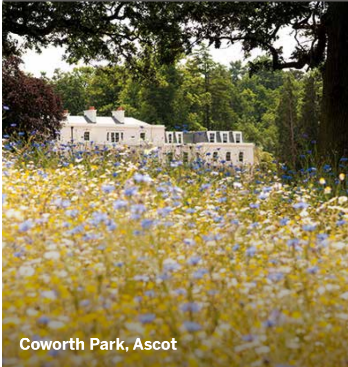
Coworth Park, Ascot