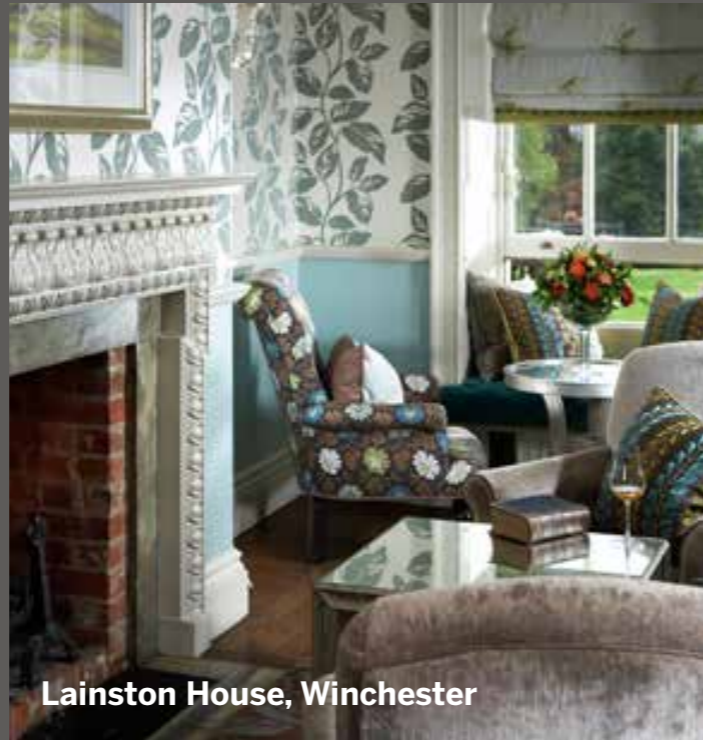
Lainston House, Winchester

To help you enjoy your stay to the full, we've arranged for you to receive a fantastic range of benefits at every property in the Collection 1 , helping make your experience even more special: