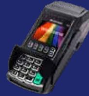
Castles V3C Models

This guide will help you start welcoming new customers as soon as possible.