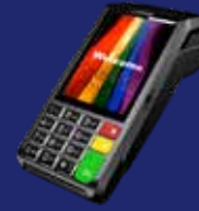
Castles V3M2 Models

If at any point you need extra assistance, give us a call on 0800 032 7216 , select option 2 and we can guide you through the set-up process.